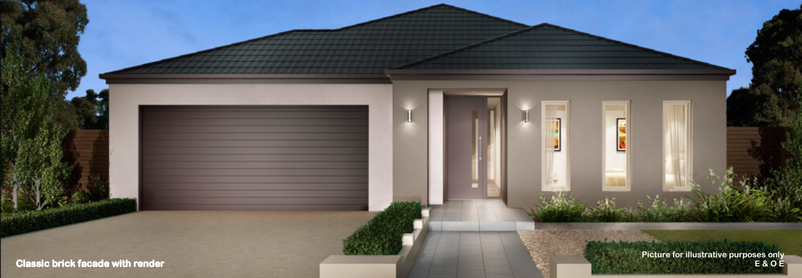
Classic brick facade with render